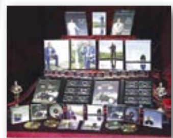
LIFESTYLES OF SUCCESS SERIES