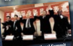
Moscow International Summit World Strategy Meeting