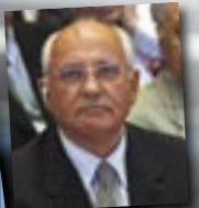
Mikhail Gorbachov at Moscow Summit